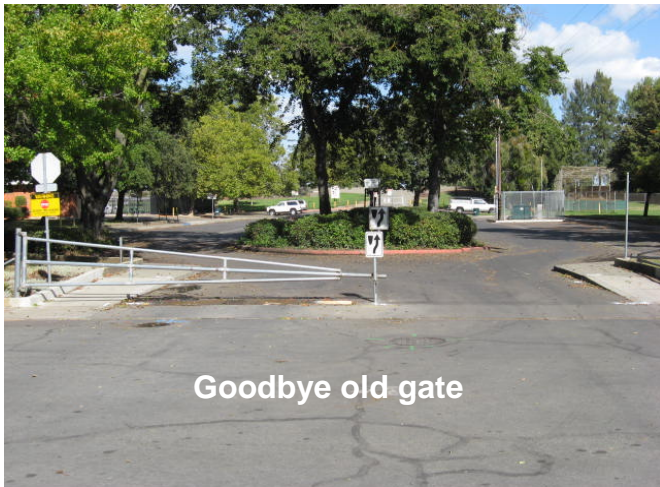
Goodbye old gate