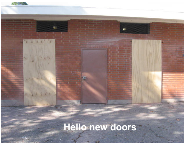
Hello new doors

Workers were also busy in late November pouring concrete and preparing for construction of a new entrance gate to the Glenn Hall Park parking lot. When completed, the gate will open electronically at dawn and automatically lock at dusk. Motion detector lights are also planned for the parking area, all in an attempt to prevent late night access to the lot and Paradise Beach.