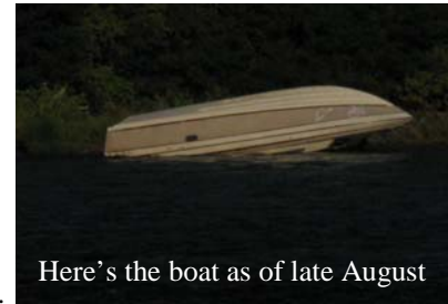
Here’s the boat as of late August

There is some indication that the City of Sacramento will attempt to remove the stranded motor boat that’s been stuck in the river opposite River Park since early February.