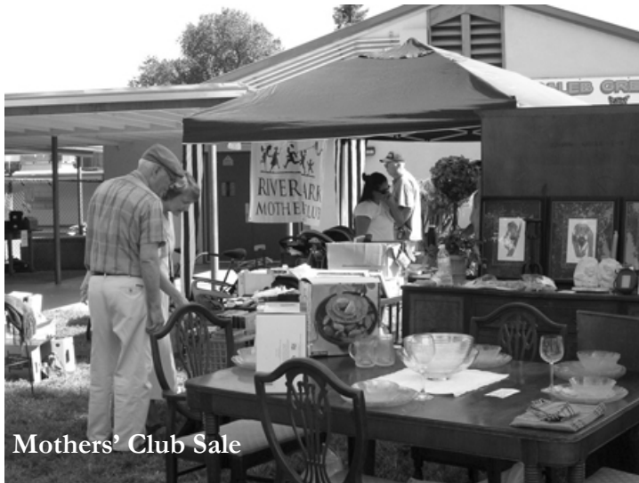
Mothers' Club Sale