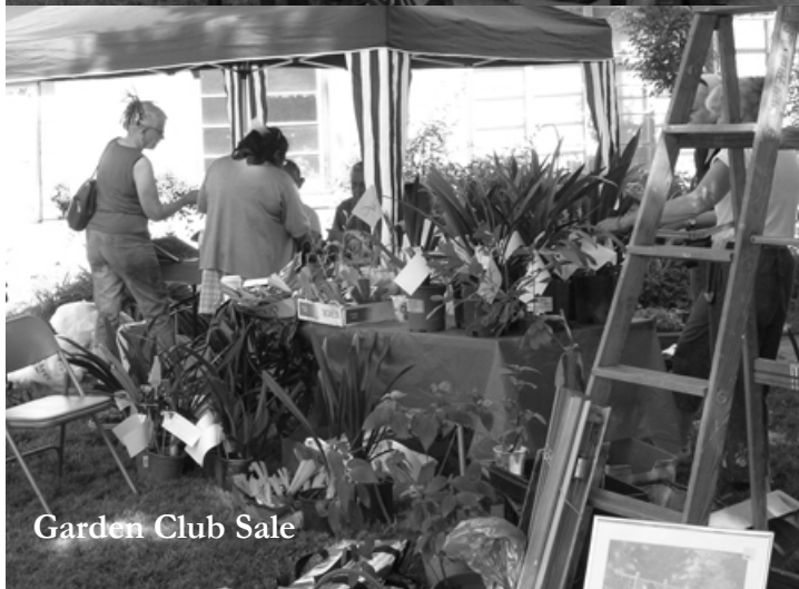
Garden Club Sale