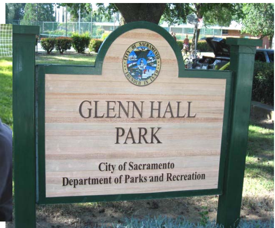
Glenn NOT Glen