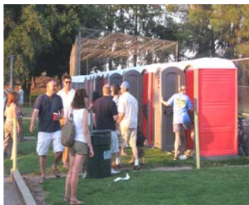
No relief lines

Next in line is the Great American River Cleanup when everyone in River Park voluntarily comes to Glen Hall Park, accepts a plastic garbage bag, then sets off to fill the bag with trash left in and near our riverfront. Saturday morning September 20. See ya!