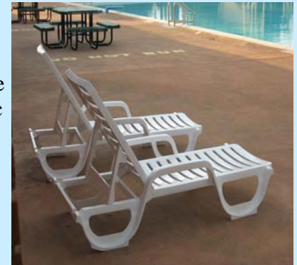
Lounge or Longue?

Four more comfy new chaise lounges are now in place at the Glen Hall Park swimming pool. The backs of the long chairs are adjustable and, being white, they don't feel so hot to the touch of bare skin. RPNA bought the four chairs for a total of $600. The funds to purchase the chairs were allocated from the $4000 Southern Pacific paid to RPNA in compensation for the March 2007 railroad trestle fire that blackened the skies with heavy smoke and gave everyone who saw the smoke plume a good scare.