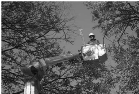
Upper photo, Sacramento City firemen direct water toward night heron nests. Lower photo, Sacramento City arborist rides into the upper tree branches to knock down empty nests.