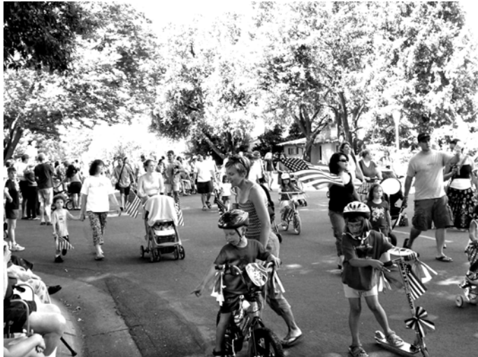
4th of July Firecracker Parade drew a large turnout of families and kids on decorated bikes, scooters and wagons.

www.riverparksacramento.net www.groups.yahoo.com/group/rpna