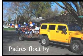
Padres float by